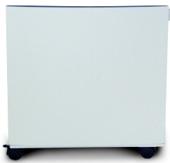
Cabinet Stand Option