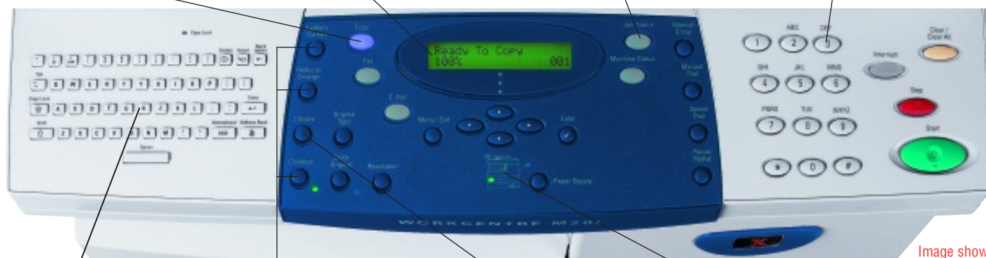
Image shown is the M20i control panel

Alpha-numeric keypad supports fax features.