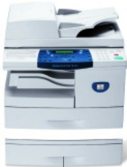
Second Paper tray Option